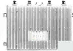
Network Unit (NU)

The Nextivity IntelliBoost® baseband processor is the first six-core processor designed specifically to optimize the indoor transmission and reception of 5G/4G/3G wireless signals. With advanced filtering, equalization, and echo-cancellation techniques, Nextivity has developed an architecture that delivers unprecedented in-building data rates and pervasive 5G/4G/3G connectivity. The IntelliBoost® processor ensures that Cel-Fi products never negatively impact the macro network while providing maximum coverage.